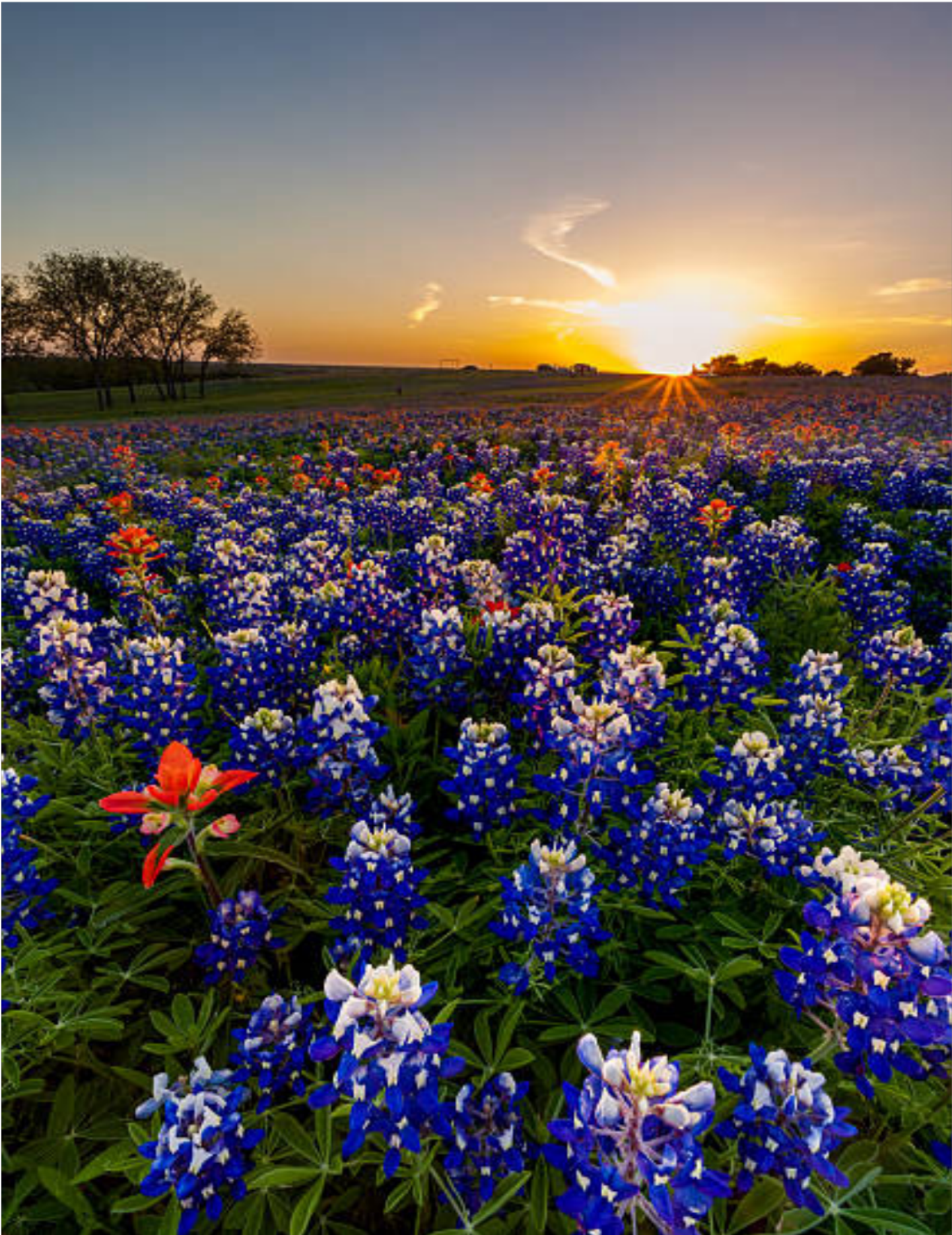
IMAGE OF IRVING, TX SURROUNDING AREA